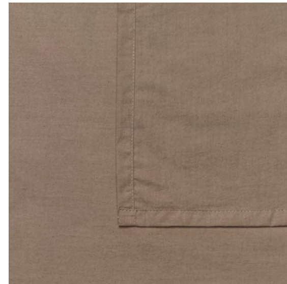
PERCALE Walnut Available sizes: 160x260 cm, 260x260 cm