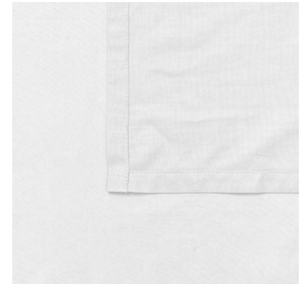
SHEET White Available sizes: 160x260 cm, 260x260 cm, 200x260