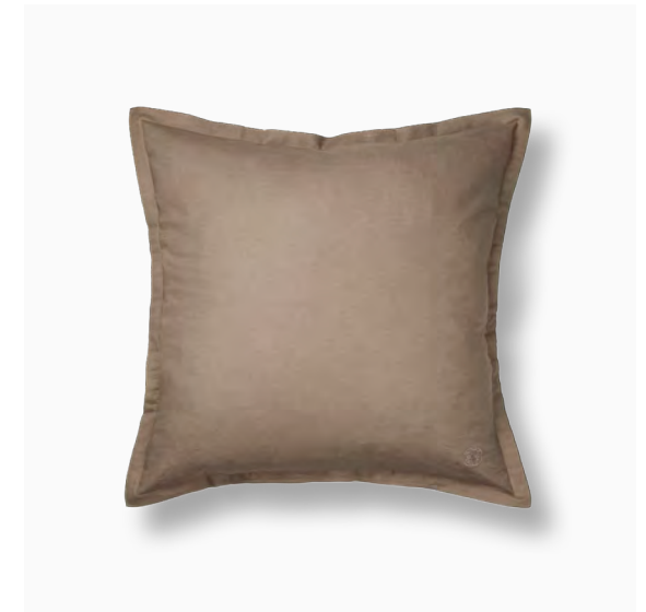
ORIGINAL CUSHION Walnut Available sizes: 50x50 cm, 40x60 cm