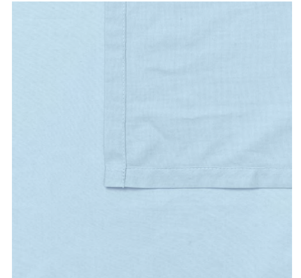
PERCALE Light Blue Available sizes: 160x260 cm, 260x260 cm