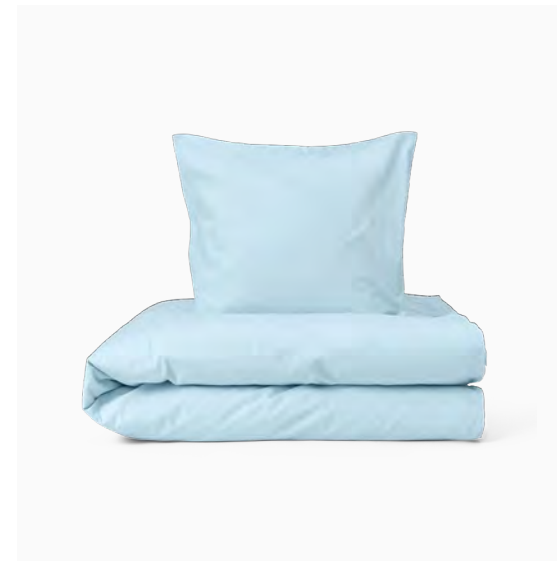
PERCALE Light Blue