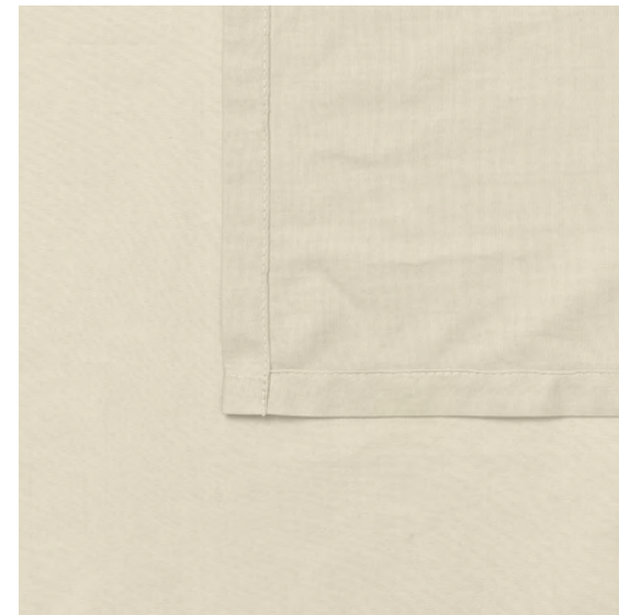
SHEET Archive Available sizes: 160x260 cm, 260x260 cm