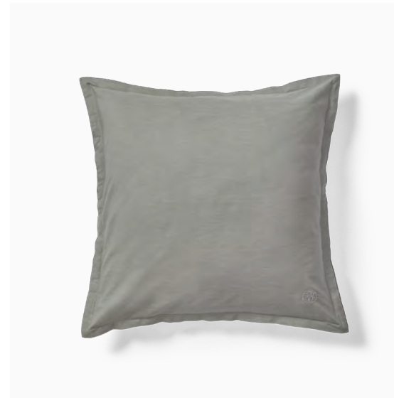
ORIGINAL CUSHION Light Grey Available sizes: 50x50 cm, 40x60 cm