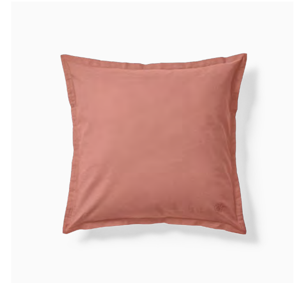
ORIGINAL CUSHION Juniper Red Available sizes: 50x50 cm, 40x60 cm