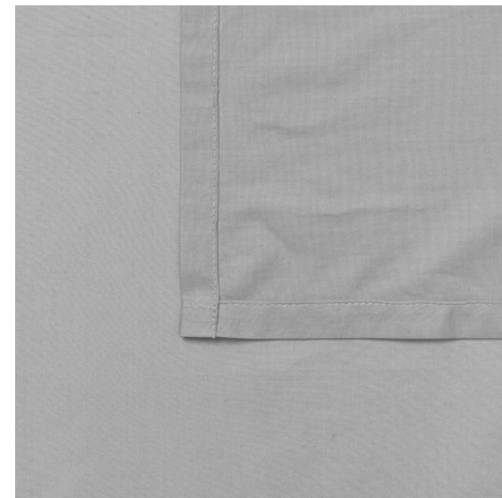
SHEET Platinum Available sizes: 160x260 cm, 260x260 cm