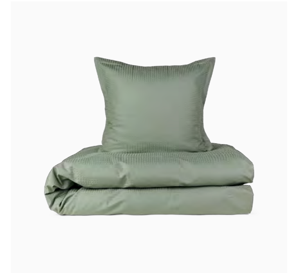
FACET Mineral Green