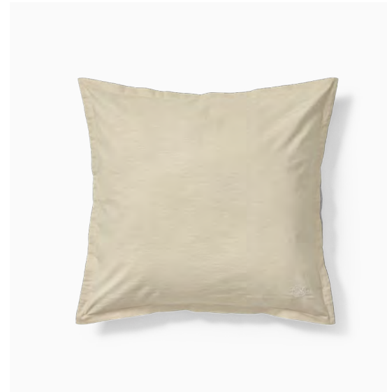
ORIGINAL CUSHION Archive Available sizes: 50x50 cm, 40x60 cm

Material: Woven from 100% cotton Design: Designed by Georg Jensen Damask