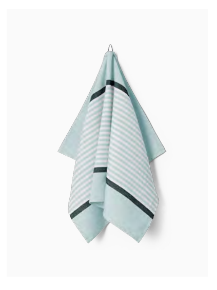
ABILD TEATOWEL Wheat Available sizes: 50x80 cm