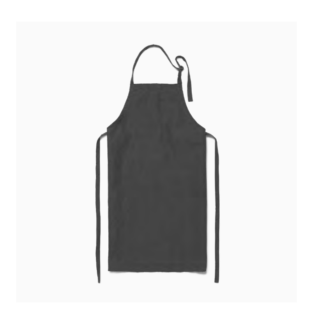
ORIGINAL APRON Dark Grey Available sizes: 65x85cm

Material: Woven from 50% cotton and 50% linen Design: Designed by Georg Jensen Damask