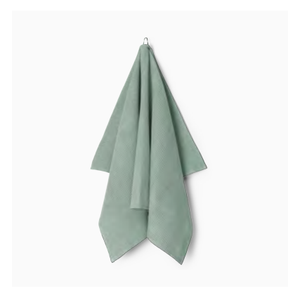
ORIGINAL WEAVE Mineral Green Available sizes: 50x80 cm