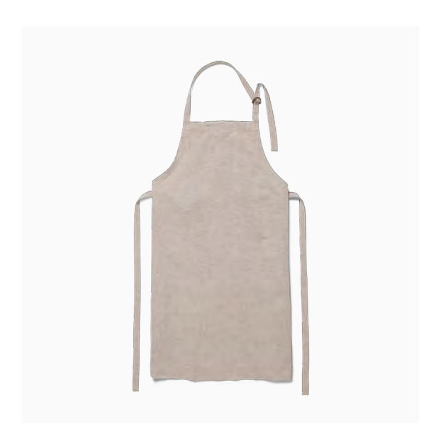
ORIGINAL APRON Ler Melange Available sizes: 65x85cm