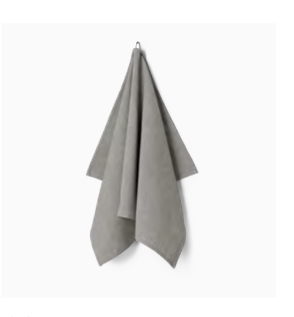
1959 Available sizes: 50x80 cm