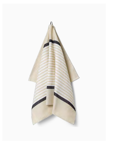
ABILD TEATOWEL Archive Available sizes: 50x80 cm

Material: Woven from 50% cotton and 50% linen Design: Designed by Bent Georg Jensen