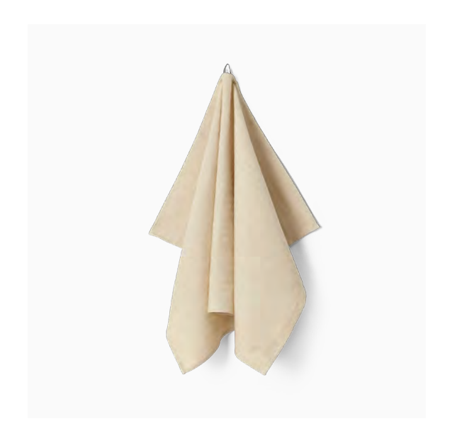
ORIGINAL STRIPE Archive Available sizes: 50x80 cm

Material: Woven from 60% cotton and 40% linen Design: Designed by Georg Jensen Damask