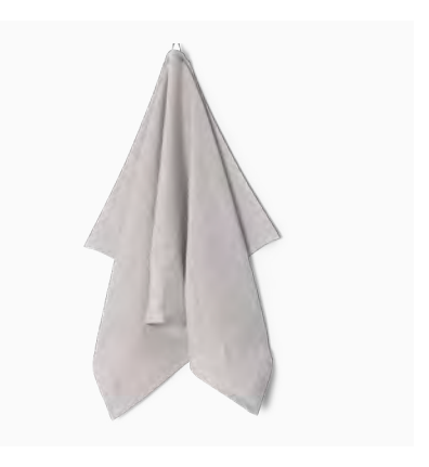
PLAIN Greige Available sizes: 50x80 cm