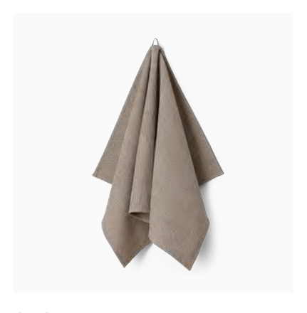
ORIGINAL WEAVE Walnut Available sizes: 50x80 cm