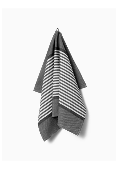
ABILD TEATOWEL Flint Available sizes: 50x80 cm