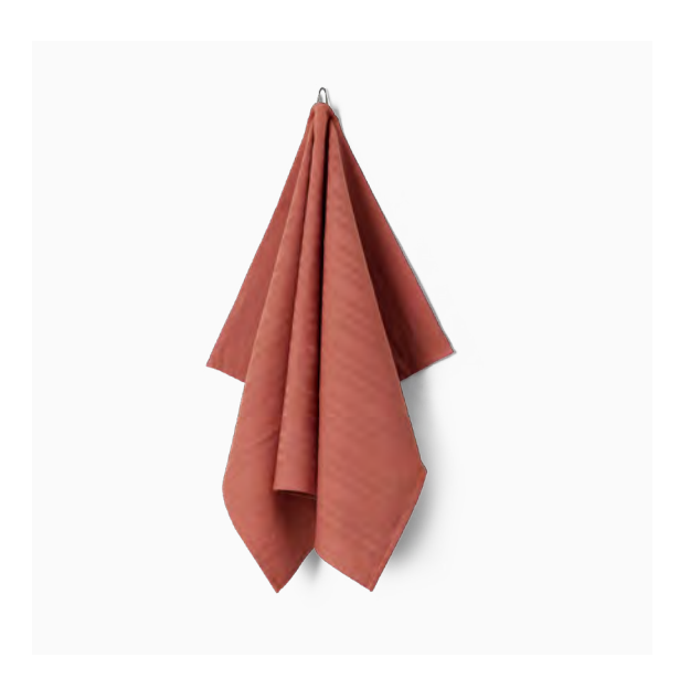
ORIGINAL STRIPE Juniper Red Available sizes: 50x80 cm