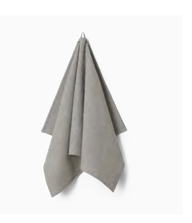
ORIGINAL WEAVE Grey Available sizes: 50x80 cm