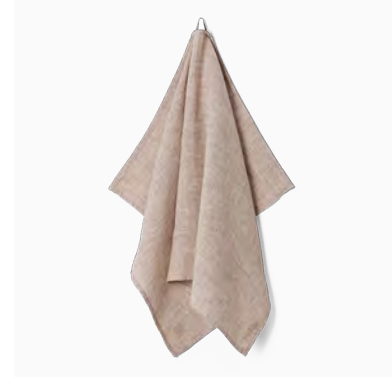
PLAIN Wheat Melange Available sizes: 50x80 cm