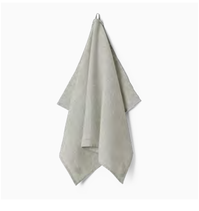
PLAIN Light Grey Melange Available sizes: 50x80 cm