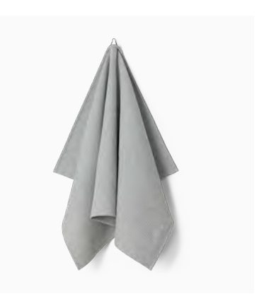
ORIGINAL WEAVE Light Grey Available sizes: 50x80 cm