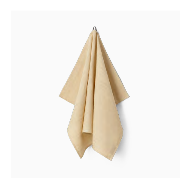
ORIGINAL STRIPE Wheat Available sizes: 50x80 cm