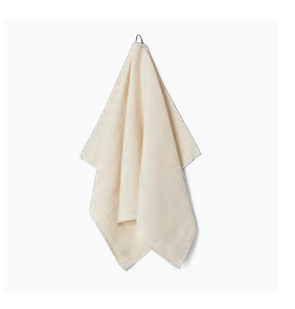
PLAIN Archive Melange Available sizes: 50x80 cm