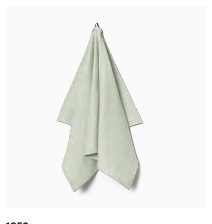
1959 Light Green Available sizes: 50x80 cm