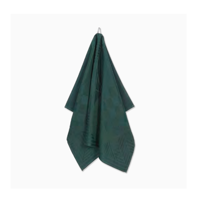
CHRISTMAS TEATOWEL København Available sizes: 50x80 cm