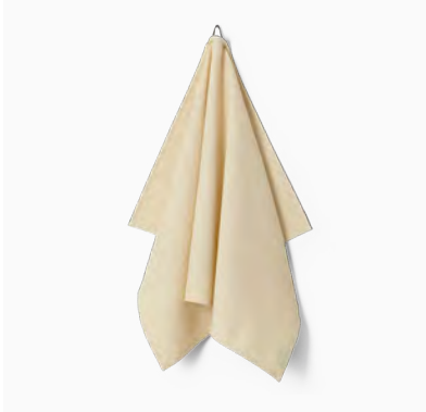
1959 Wheat Available sizes: 50x80 cm