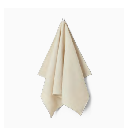
ORIGINAL WEAVE Archive Available sizes: 50x80 cm

Material: Woven from 100% cotton Design: Designed by Georg Jensen Damask.