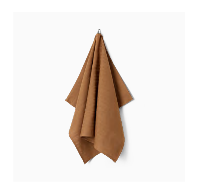
ORIGINAL STRIPE Ler Available sizes: 50x80 cm