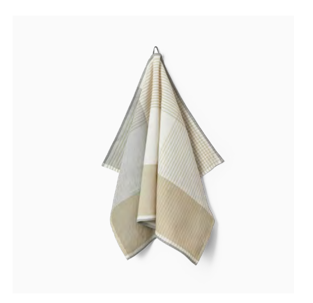
BECKER TEATOWEL Archive

Material: Woven from 50% cotton and 50% linen Design: Designed by John Becker