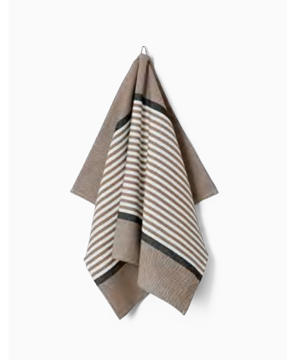
ABILD TEATOWEL Walnut Available sizes: 50x80 cm