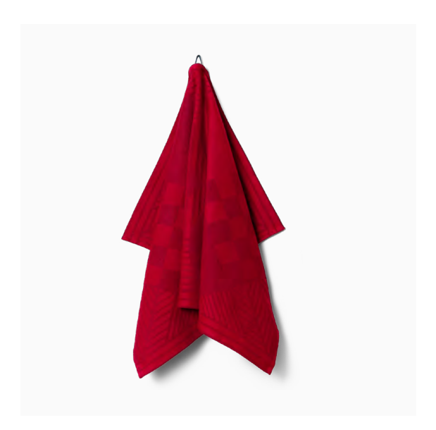
CHRISTMAS TEATOWEL Deep Red Available sizes: 50x80 cm

Material: Woven from 50% cotton and 50% linen Design: Designed by Bodil Bødtker-Næss