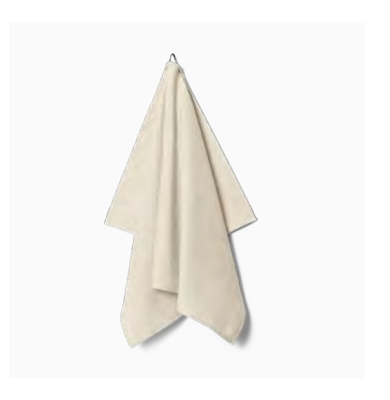
1959 Archive Available sizes: 50x80 cm

Material: Woven from 100% cotton Design: Designed by Bent Georg Jensen