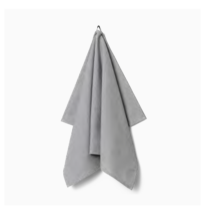
1959 Light Grey Available sizes: 50x80 cm