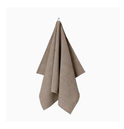
1959 Walnut Available sizes: 50x80 cm