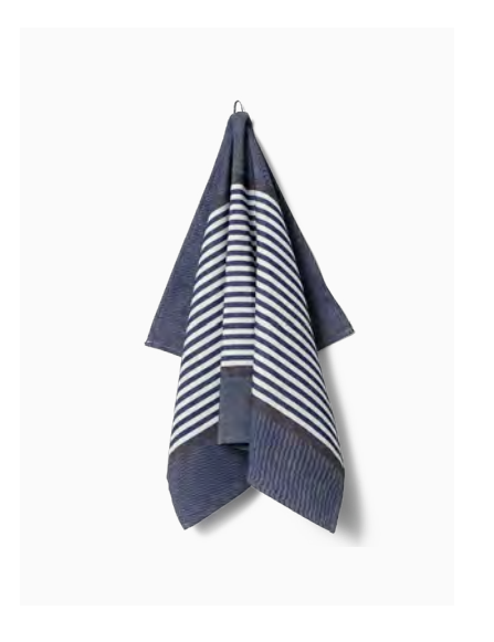
ABILD TEATOWEL Deep Blue Available sizes: 50x80 cm