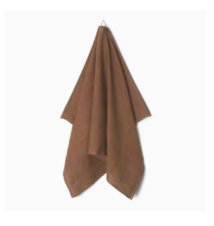
PLAIN Mahogany Brown Available sizes: 50x80 cm