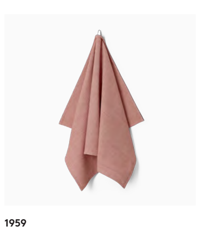
Juniper Red Available sizes: 50x80 cm