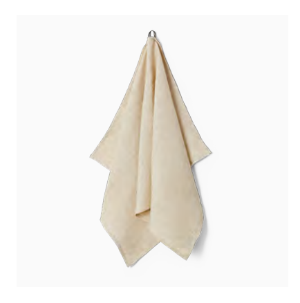
PLAIN Ler Melange Available sizes: 50x80 cm