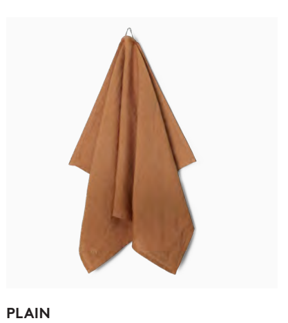
Available sizes: 50x80 cm